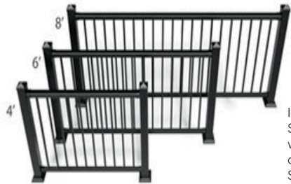
Illustration shows Standard Railing Kit with two posts. (Posts are NOT included in the Standard Railing Kit).

Standard Railing Kit available in square balusters only. Posts are sold separately - see "Post Options".